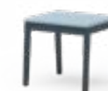
CLYDE 37X STOOL SOLID WOOD FRAME