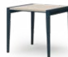
CLYDE 3700 FOUR-LEGGED TABLE SOLID WOOD FRAME