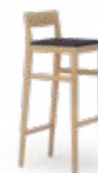
CLYDE 369 BAR STOOL SOLID WOOD FRAME | PLYWOOD