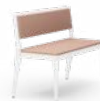
CLYDE 374 2-SEATER BENCH SOLID WOOD FRAME | PLYWOOD