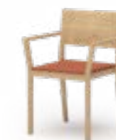
CLYDE 373 STACKING CHAIR SOLID WOOD FRAME | PLYWOOD