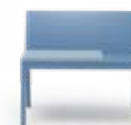
CLYDE 37X LOUNGE SOFA SOLID WOOD FRAME | PLYWOOD